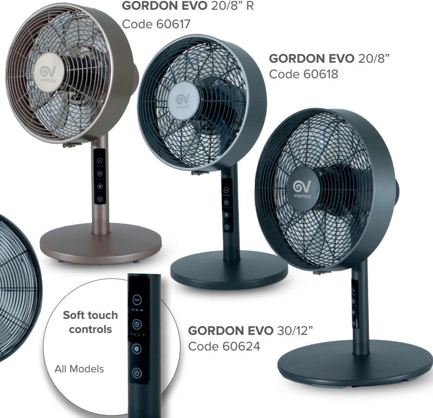
GORDON EVO 20/8" Code 60618