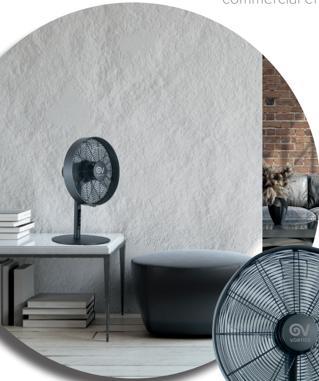
GORDON EVO 20/8" R Code 60617

New range of 5 oscillating fans, in table and floor version, equipped with soft-touch and remote controls (depending on the model), with a clean and modern aesthetic that integrates perfectly into both domestic and commercial environments such as shops or offices.